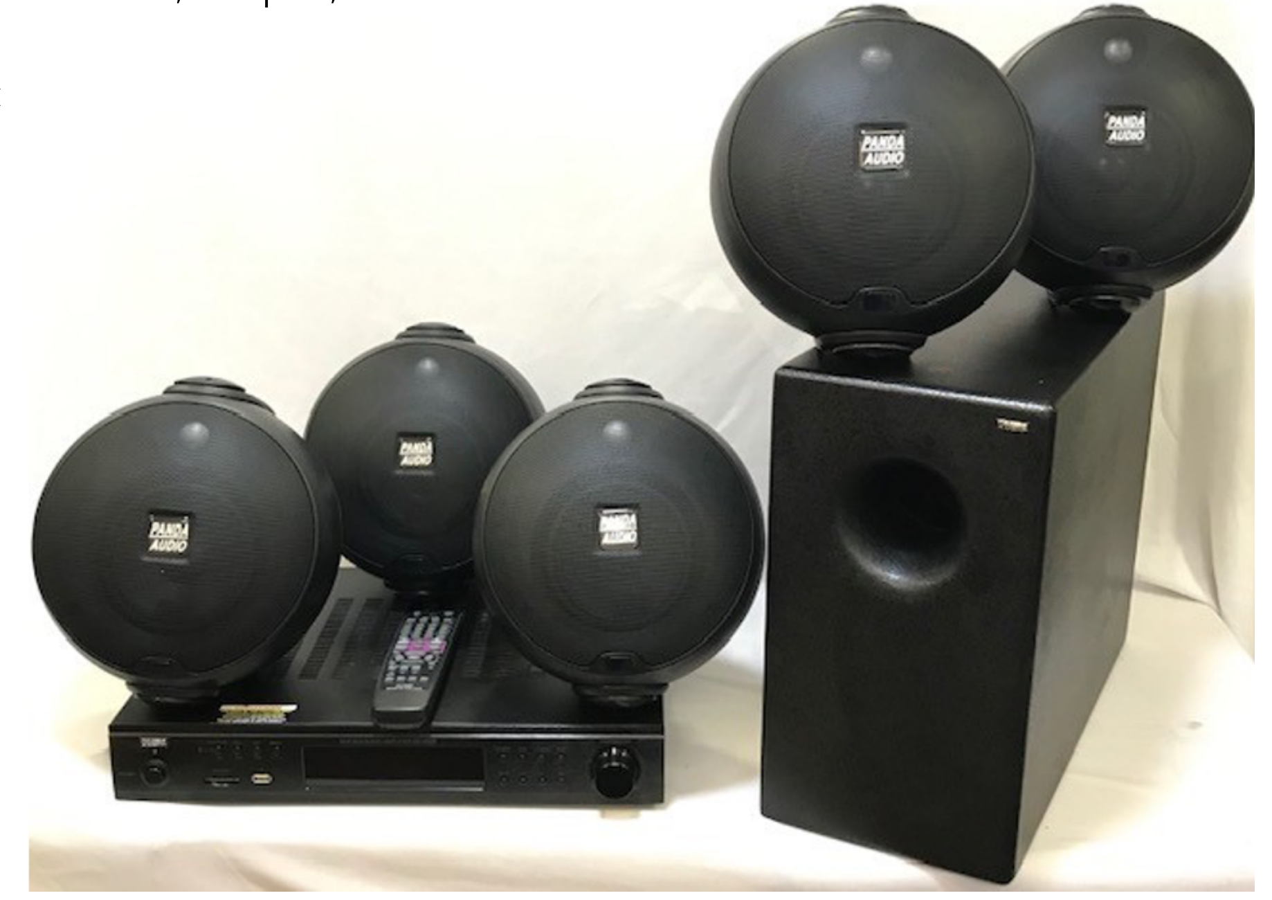
For 5.1 amplifier specifications refer to model KV-9898-A shown above.