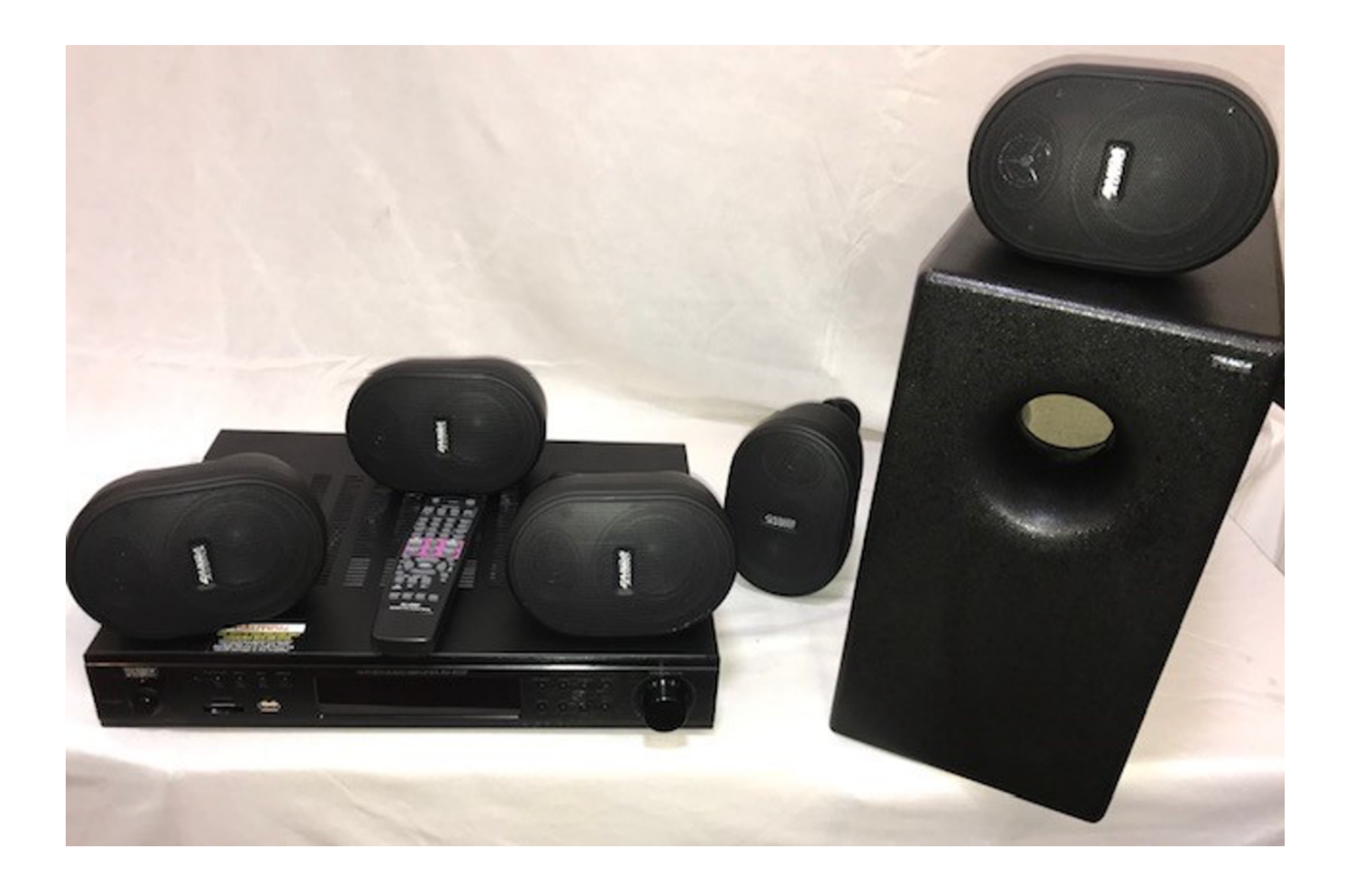
For 5.1 amplifier specifications refer to model KV-9898-A shown above.