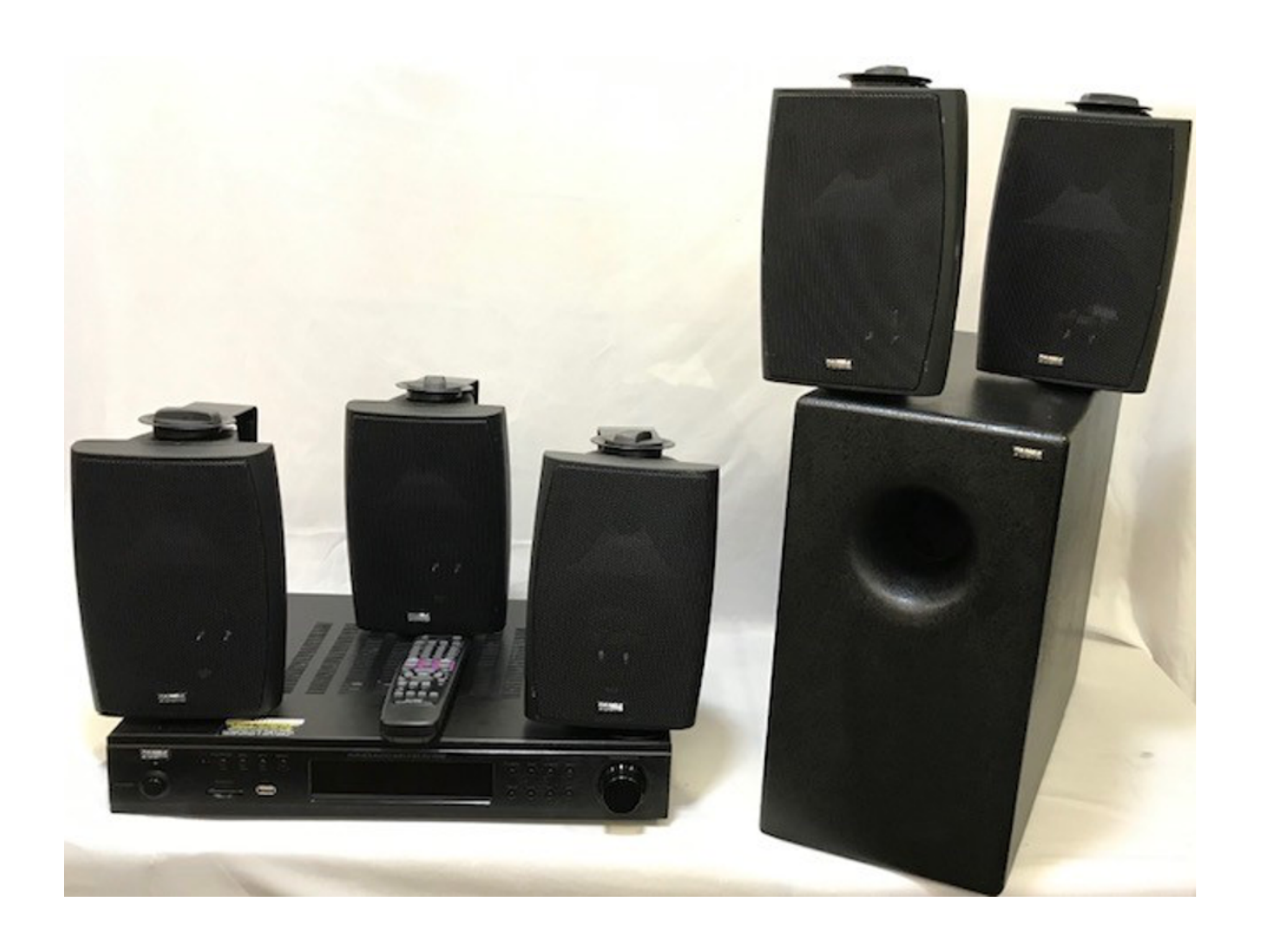
For 5.1 amplifier specifications refer to model KV-9898-A shown above.