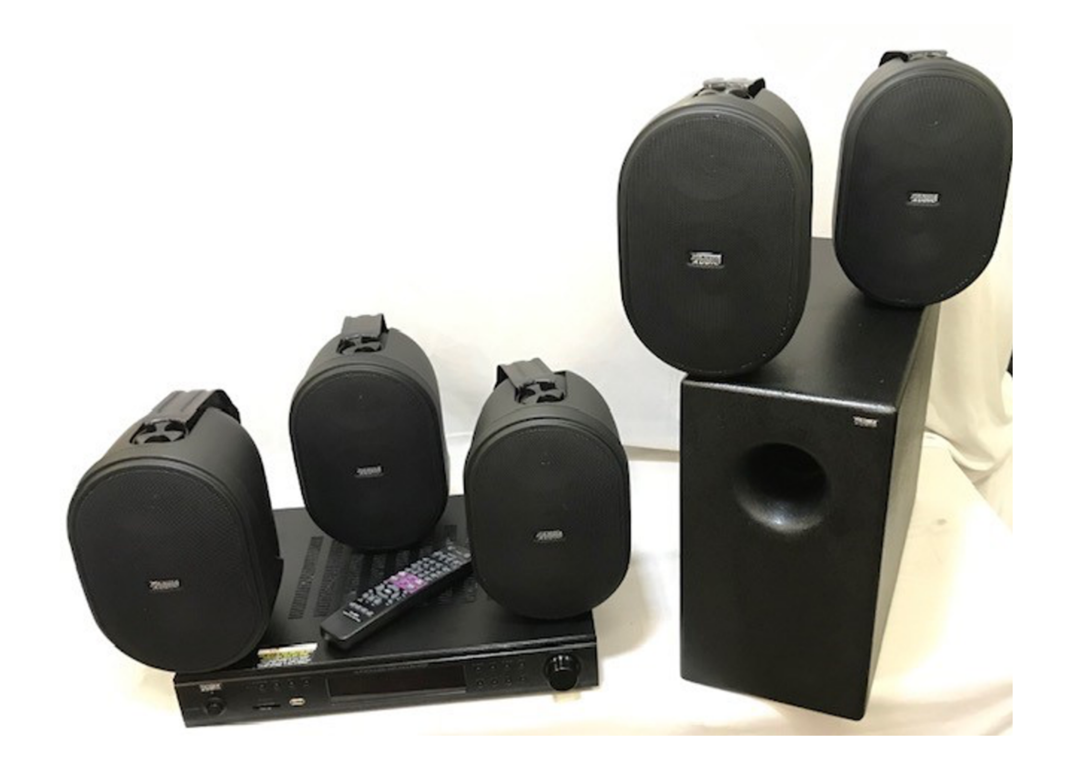
For 5.1 amplifier specifications refer to model KV-9898-A shown above.