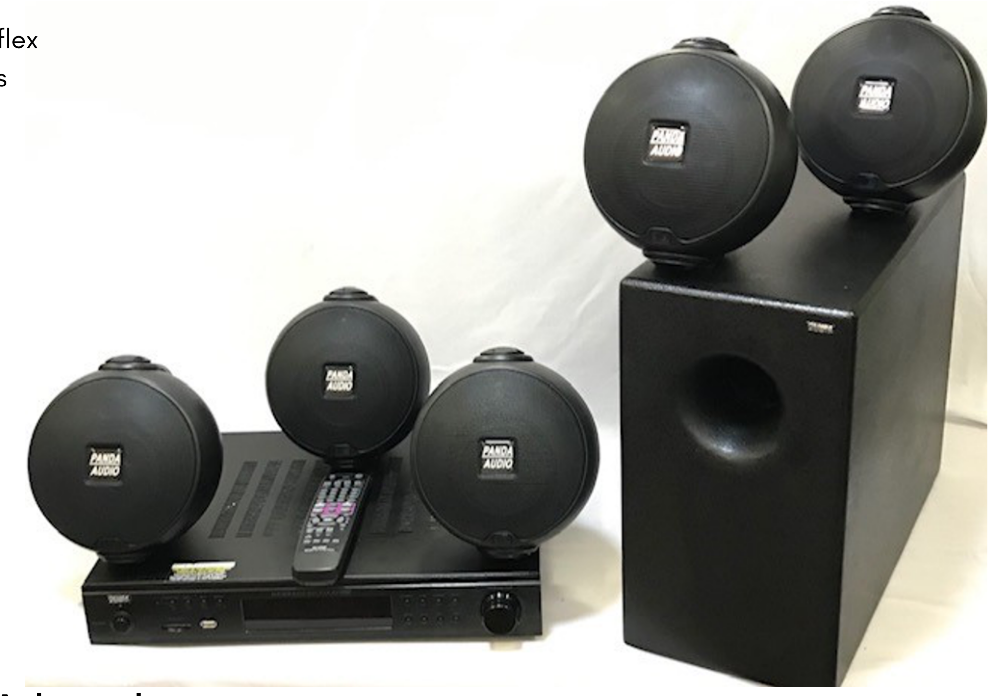
For 5.1 amplifier specifications refer to model KV-9898-A shown above.